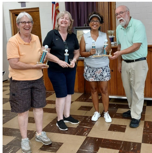
YMSofR as well as the work of local parish YMSofR Branches.