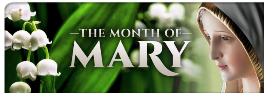
By Plinio Corrêa de Oliveira

ALL WHO ARE IN NURSING HOMES OR ASSISTED LIVING ALL ACTIVE & RETIRED CLERGY NEEDING HEALING ALL SERVICE MEN AND WOMEN AROUND THE WORLD Bless them, O Lord. Pobjogoslav im, O Boze