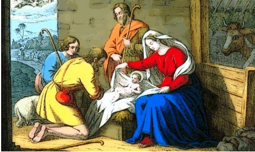
PROCESSION TO MANGER – “Sliczna Panienska”

Prior to the beginning of Mass, assistants will come up to the edge of each aisle, bringing the lit flame to the candles you were handed upon your arrival. This is the Light of Christ, which will symbolically be brought from the Congregation to the Christ Candle on the altar. Please, everyone leave your candles lit until after the Christ Candle has been lighted.