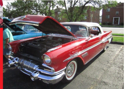
Best Of Show 57' Bonneville